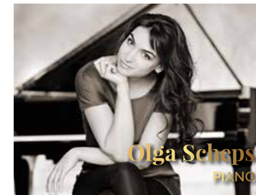
Olga Scheps PIANO