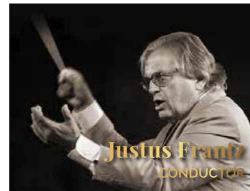
Justus Frantz CONDUCTOR

Franz Liszt: Les Preludes , S. 97 (Symphonic Poem No. 3) Camille Saint-Saëns: Violoncello Concerto No. 1 in a minor, Op. 33 Antonin Dvořák: Symphony No. 9 in e minor, Op. 95, "From the New World"